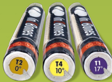
STERILE DELIVERY TUBES