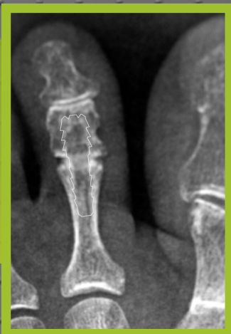
Radio Transparent PEEK-OPTIMA ®